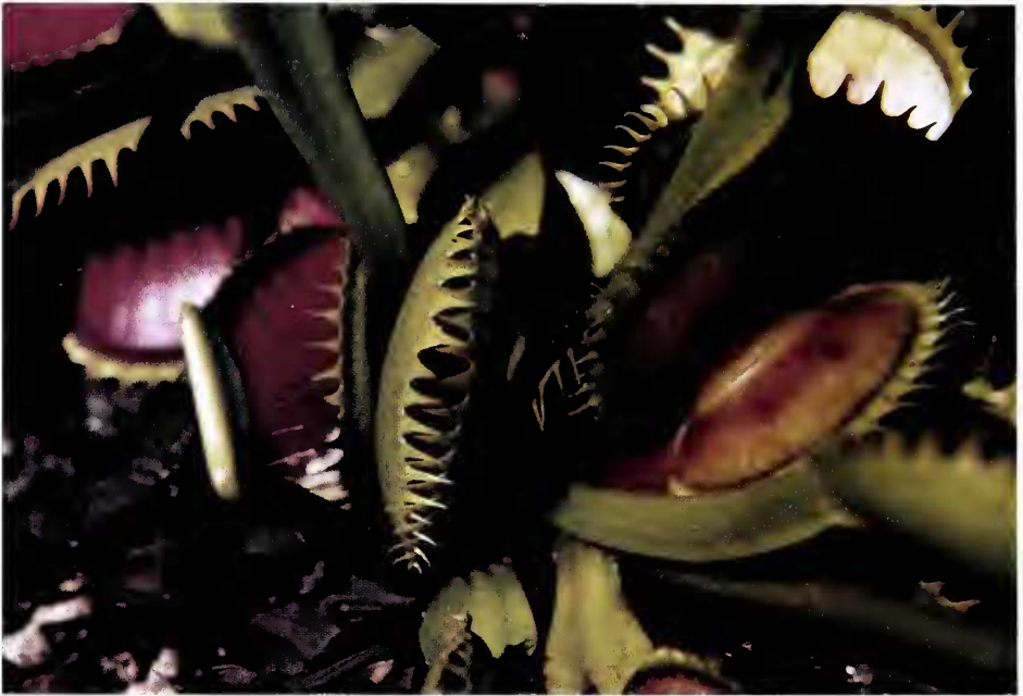
Figure 1: Dionaea 'Jaws'.